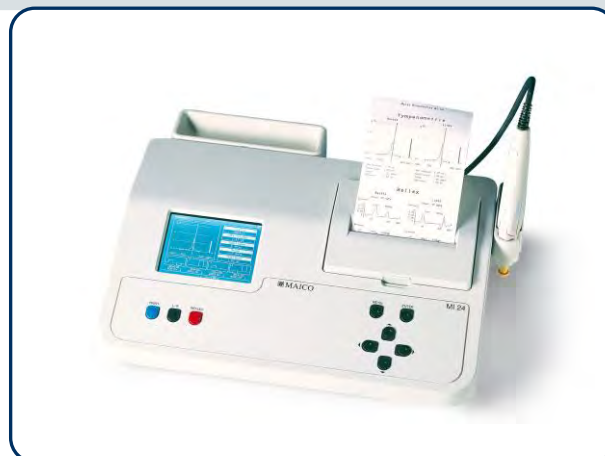
MI 24 with optional connector cover