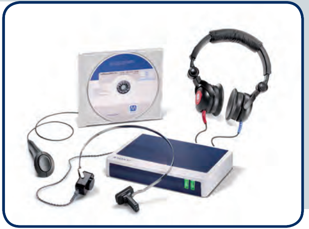
MA 33 with headset DD45, B71, response button and software

These various versions make the MA 33 the ideal device for every ENT specialist, whether you are an ENT doctor, general practitioner, audiologist, pediatrician or work in occupational health.