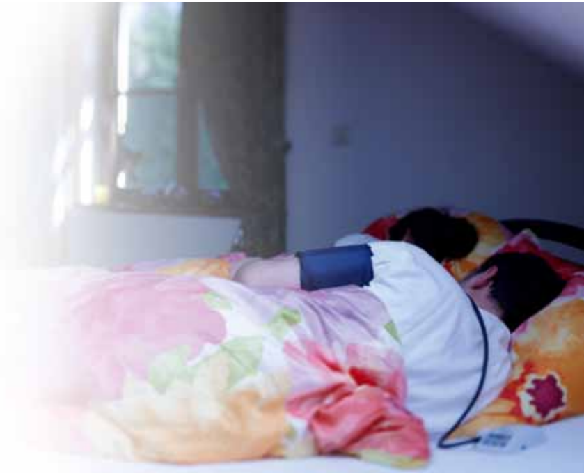
Sleeping through the night without difficulty