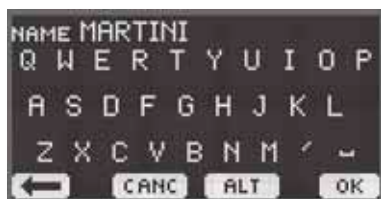
Patient Data Entry