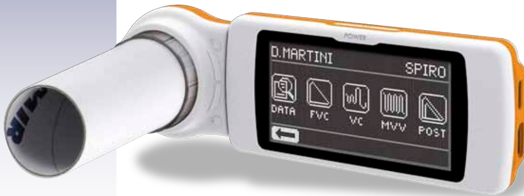
Spirometry menu in "Doctor mode"