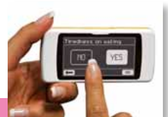
Questionnaire for home care symptom control