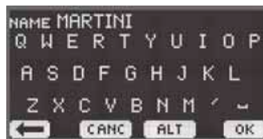
Patient data entry