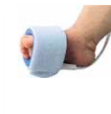
Neonatal flex probe