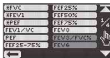
Choice of spirometric parameters

FVC, VC, IVC, MVV, PRE-POST. Precise spirometry interpretation including post bronchodilator. All tests are automatically memorized. Automatic BTPS conversion. Memory capacity: 10.000 tests. Wide selection of predicted values.