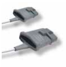
Paediatric and adult finger probe