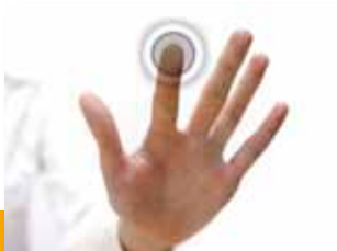
Spirometer with "Touch Screen" display