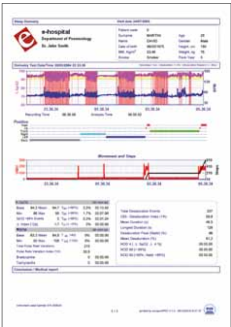
Printout of sleep oximetry with desaturation analysis

All tests and curves for every patient in the memory can be reviewed on a single page and the results, including oximetry tests, can be compared.