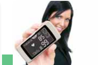
Pulse Oximeter "intelligent" with on screen results