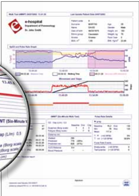
Printout of the 6 minute walking test: baseline, walk, recovery

WinspiroPRO is a unique featured PC software, which comes standard with all MIR spirometers and oximeters.