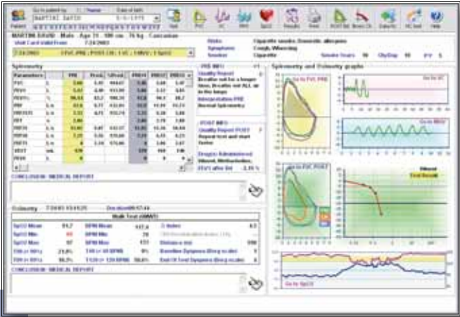
Summary of all tests carried out

The latest version provides an innovative user interface, including a detailed motion analysis.