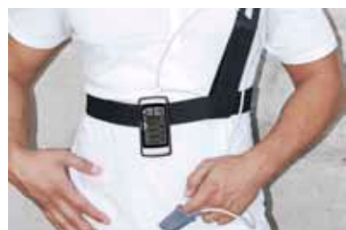
Belt with silicon holder (option).