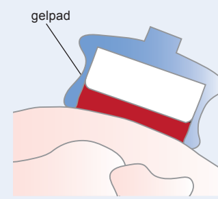
Contact surface when applying a StatUS^{TM} applicator and the special gelpad.