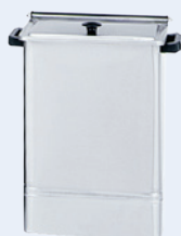
3448265 PACKHEATER E-1