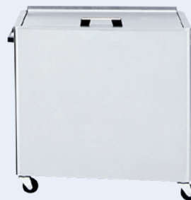
3448262 PACKHEATER M-4