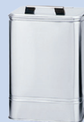
3448264 PACKHEATER E-2