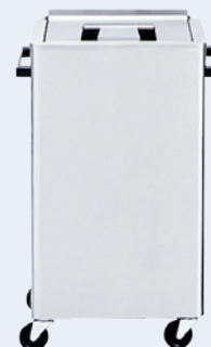
3448260 PACKHEATER SS-2