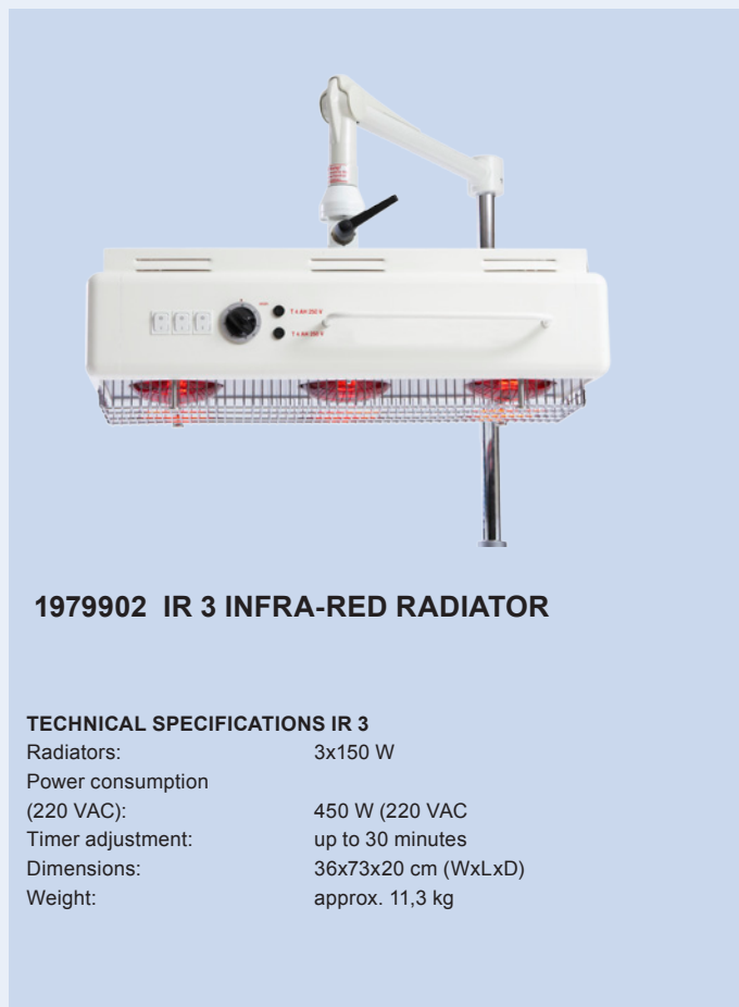
1979902 IR 3 INFRA-RED RADIATOR