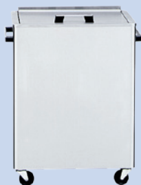
3448261 PACKHEATER M-2