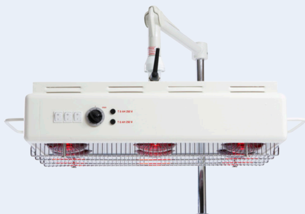
1979901 IR 6 INFRA-RED RADIATOR

Positioning is easy because of the specially developed fast fixation device. The unit must be ordered with a stable mobile stand, with height adjustment and safety locks on the wheels.