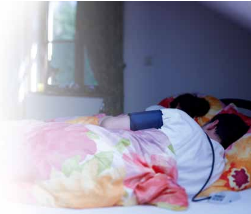
Sleeping through the night without difficulty